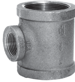
FIGURE 1105R Reducing Tee (Cont'd.)